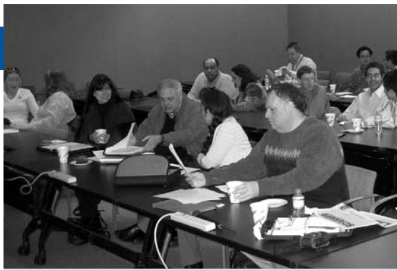
Leadership Training —New IEEE officers and volunteers learn from those with more experience.

Preregistration is required for food and materials planning. For details, see the Calendar listing, p. 3.